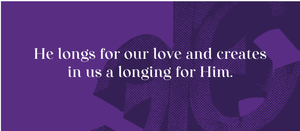
Enough is our Concordia University Texas theme for the 2023-2024 academic year.